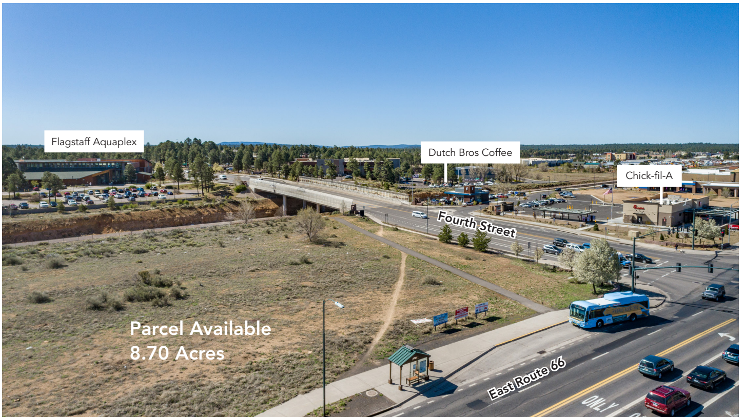
Above: City of Flagstaff mandated future alignment of J.W. Powell Blvd. from Butler Ave. and Fourth St. to Interstate 17. Below: Available parcel location with direct access to Flagstaff Mountain Line transit